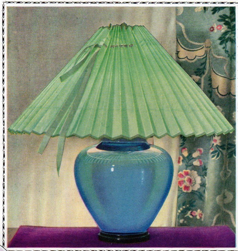
A lamp made from a water jar of gorgeous blue. Equally fascinating are lamp bowls of ruby red, of amber, Spanish green, or amethyst

Every piece in the Steuben collection is designed by an artist glass-maker honored