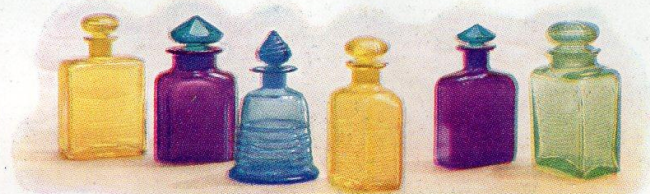
The new bathroom bottles! Used in sets all of one color or in whatever way your decorative scheme requires

on two continents for his masterly achievements. Under his direction, craftsmen with that rare delicacy and sureness of touch which distinguish the worker in the arts from other men, fashion by hand each lovely piece.