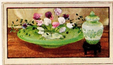
Fluent contours, cool exquisite colors characterize Steuben glass designed for summer entertaining. It may be had in single pieces or entire sets—such as this of crystal and rose hued Grenadine—in Jade Green, Amber, Celeste Blue and other lovely shades

The blossoms of summer's gardens are matched in their variety by the individual grace of the many Steuben vases. Two of the delightful forms originated at Steuben Furnaces are shown below in Jade Green